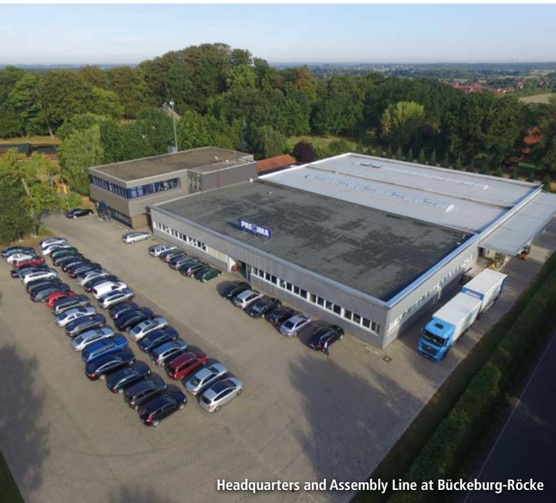
Headquarters and Assembly Line at Bückeberg-Röcke