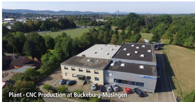
Plant - CNC Production at Bückeberg-Müsing