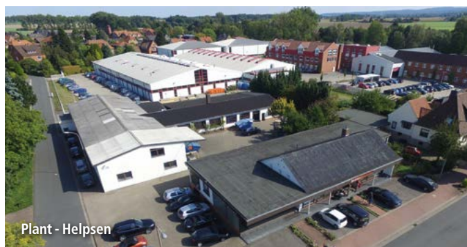
Plant - Helpsen

PRECIMA Magnettechnik GmbH was founded in the year 1981 and is today established as an independent, medium sized, innovative family owned brake manufacturer. With our staff of more than 160 employees we develop and produce a wide range of electro-magnetic operated brakes and clutches for all kinds of applications in machine and other industries. Our standard range of products covers a performance scope of braking torques between 0.5 and 1,600 Nm.